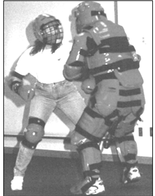
A R.A.D. student faces an "attacker" in the simulation training at the end of the class.

Self Defense Classes for men are also available. Check our web site for more information.