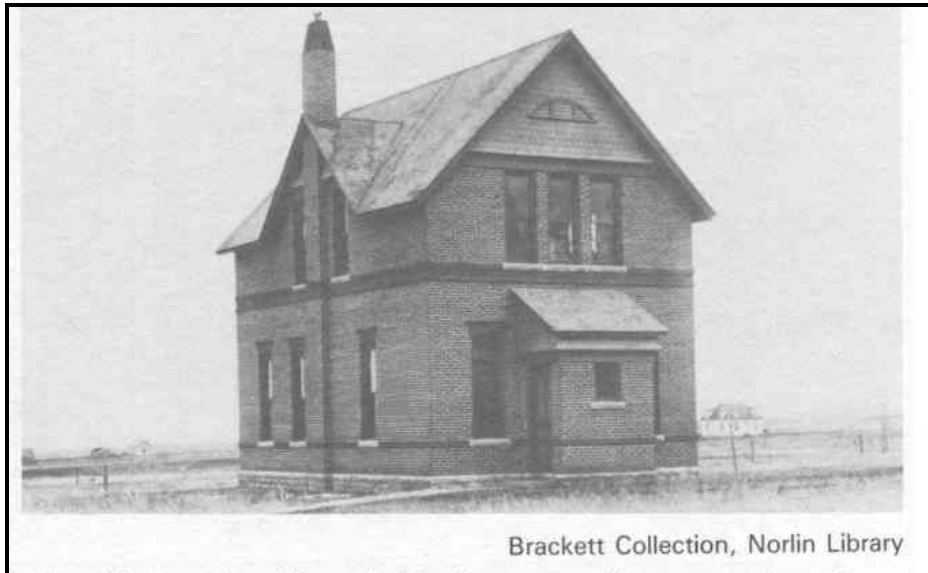
Brackett Collection, Norlin Library