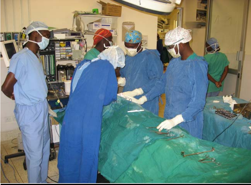
The OR in Tenwek Hospital

world. My experience provided me not only with a chance to hone my clinical skills, but also to re-evaluate what it means to be a surgeon and care for the less-fortunate.